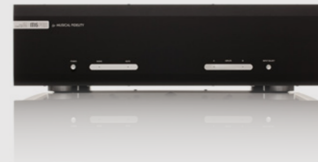
M6PRX | POWER AMPLIFIER