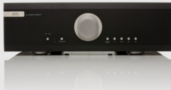
AMS35i | DUAL MONO INTEGRATED AMPLIFIER

All this plus the premium build quality and fabulous finish found across the entire AMS range. The AMS CD is a reference source you'll be proud to own and love to listen to.