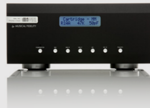
M1ViNL | PHONO STAGE

The M1 DAC has been met with incredible acclaim. Stereophile's review said it "offers performance that is close to the state of the art", calling it "a piece of kit that can transform your system" and "a stunning bargain".