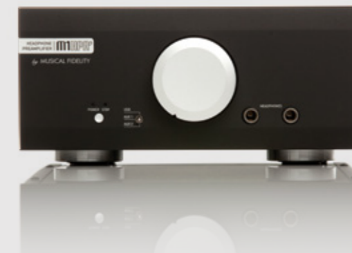
M1HPAP | HEADPHONE AMPLIFIERS

The M1 ViNL even allows you to switch resistance, capacitance or equalisation curve while you're playing records – so you can instantly hear the effect of each mode and more easily find the optimum settings for different cartridges and discs. A clear display and intuitive controls make the process simpler still.