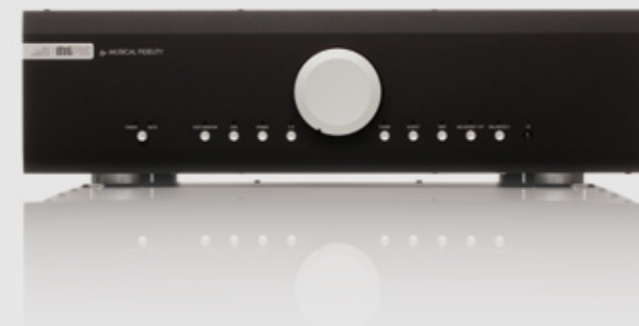
M6PRE | PRE-AMPLIFIER

From its technical measurements to its jaw-dropping sound, the M6 500i acts like an amp costing many times the money.