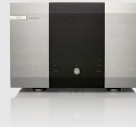
AMS100 | CLASS A POWER AMPLIFIER