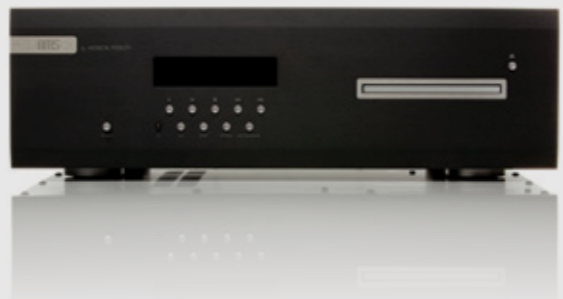
AMSCD | REFERENCE CD PLAYER

Quite simply, the AMS CD is the finest digital product we've ever made. It combines reference-standard CD playback with a multi-input DAC; it's the true Hi-Fi heart of a modern music system.