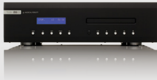
M6CD | 24 BIT 192KHz CD PLAYER

So much more than a mere CD player, the M6CD is a hub for all your digital entertainment – and the perfect source for the rest of the M6 range.