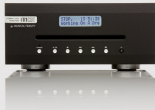
M1CDT | COMPACT DISC TRANSPORT

The M1 CLiC's exceptional capabilities may mean it's a hard product to categorise, but they make it easy to praise. EISA - Europe's most prestigious technology association – named the M1 CLiC as Best Network Player in its 2011-2012 Awards; Gramophone's review called it "remarkable for the money", Hi-Fi News dubbed it "outstanding" and Hi-Fi World declared 'it's hard to think of another product that's as versatile'.