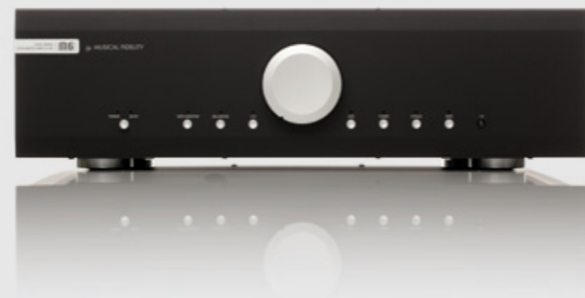
M6i | DUO MONO INTEGRATED AMPLIFIER