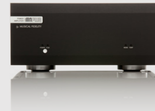
M1PWR | POWER AMPLIFIER

The M1 HPAP has already received much acclaim: the Hi-Fi Choice review stated "you might have to pay five times the HPA's asking price to significantly better its performance", while the Hi-Fi News group test concluded: "on excellent sound, facilities and value for money, the M1 HPAP is a clear winner."