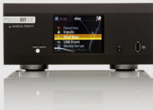
M1CLiC | UNIVERSAL MUSIC CONTROLLER

We describe the M1 CLiC as a universal music controller for all your digital and analogue sources.