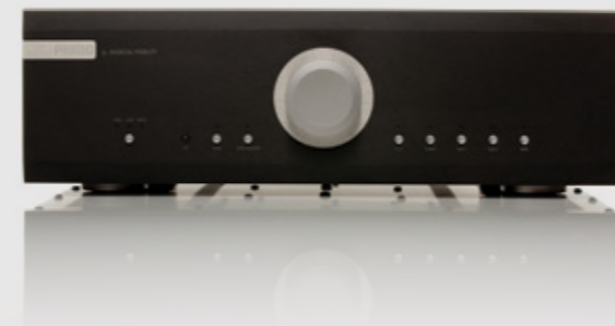
PRIMO | PRIMO PREAMP

This pure Class A design is essentially a discrete pre-amp neatly paired with dual-mono power amps within one box. It uses trickle-down technology from our flagship TITAN amplifier, sharing that powerhouse's characteristics in terms of low distortion, minimal noise, wide bandwidth and excellent load-driving ability. The latter means that despite its relatively modest 35 Watts-per-channel output, the AMS35i will effortlessly power all but the most demanding of speakers and fill all but the largest of rooms.