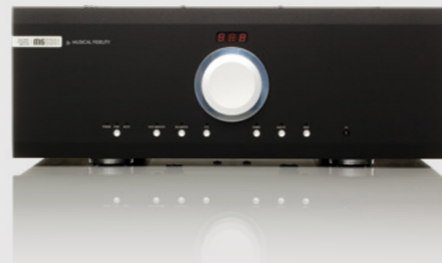
M6500i | DUAL MONO INTEGRATED AMPLIFIER

The M6i has the power and technical sophistication to drive any speaker with ease, sounding calm and unruffled as it moves from quiet musical moments to huge dynamic shifts.