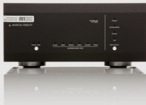
M1DAC | UPSAMPLING D/A CONVERTER

For sound and styling, the slot-loading M1 CDT is the perfect partner for the M1 CLiC or M1 DAC. The resultant compact pairing will take up the same space as a conventional-sized CD player and yet deliver so much more in terms of flexibility and performance.