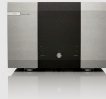
AMS50 | CLASS A POWER AMPLIFIER

The Primo is a truly extraordinary pre-amp - if you want to recapture the magic of music, it has to be heard.